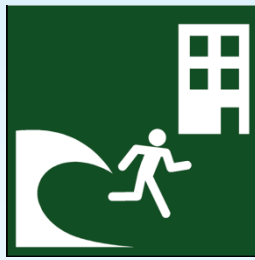
Escape route to a building with at least 4 floors