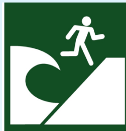
Escape route to an assembly zone